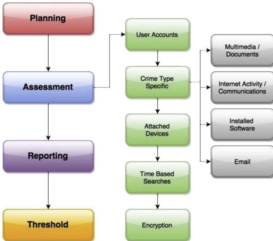
Fig. 2. Digital Field Triage model.

Usually a computer would be one of the first items to be assessed, so the TCU approved tool would create a list of